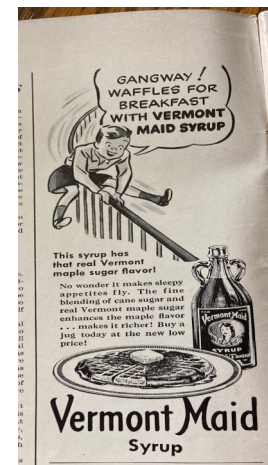
Advertisement for Vermont maple syrup product published in Life Magazine, March 10, 1941